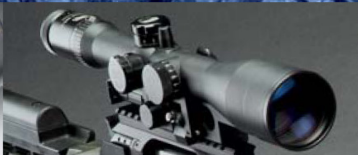
Telescopic Sight 3-12 x 56 SSG-P